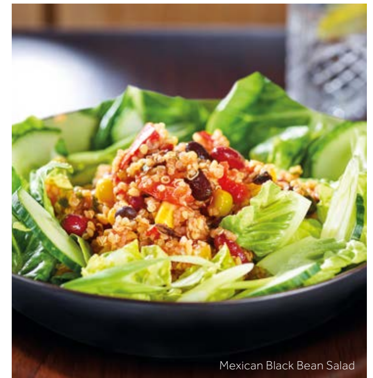
Mexican Black Bean Salad