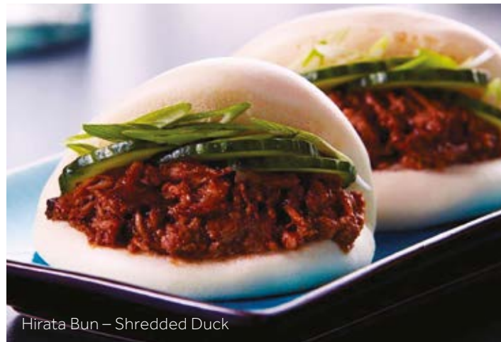
Hirata Bun – Shredded Duck